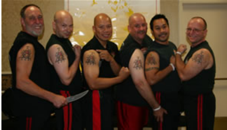
Hufana Traditional Arnis (HTAI) – The Tattoo's True Dedication