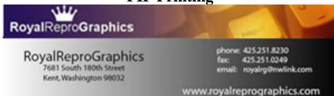
Royal Repro Graphics