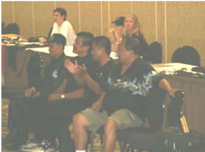
Enjoying the Competition