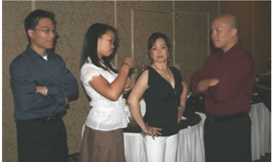
The Hufana Family