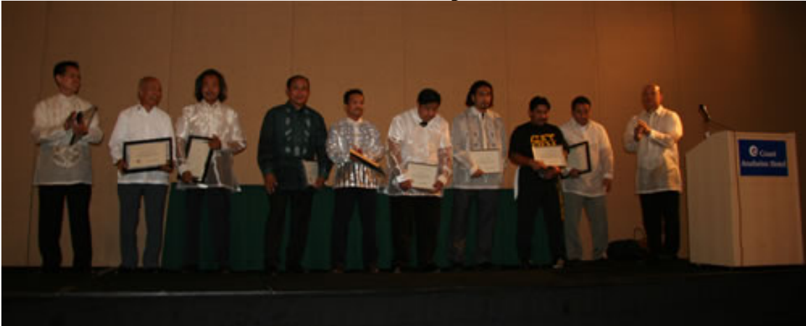
Coast Anaheim Hotel, Anaheim, California