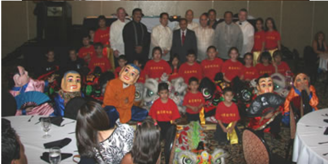
Instructors of the WFMAA event posing with the Lohan performance group.