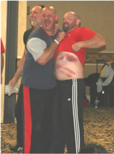
Hey! Look who needs to practice blocking.