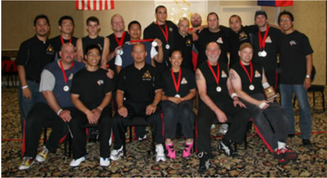
HTAI - Hufana Traditional Arnis International