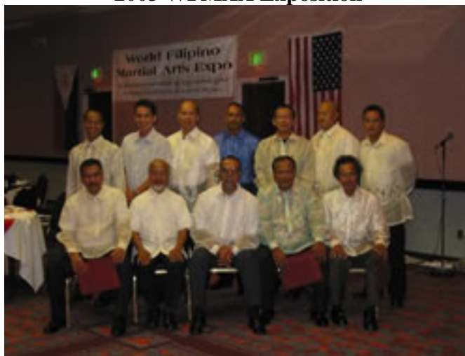
Embassy Suites Hotel, Bellevue, Washington