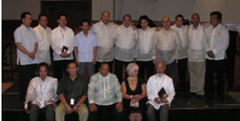
The Palms Casino & Resort Hotel, Las Vegas, Nevada