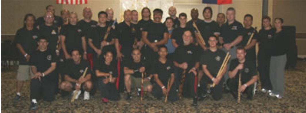
End of the first day of Seminars