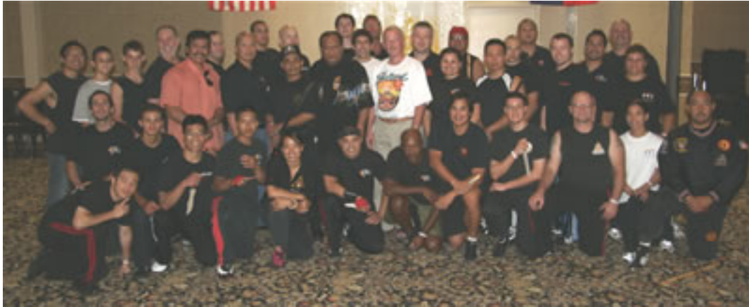
End of the second day of Seminars