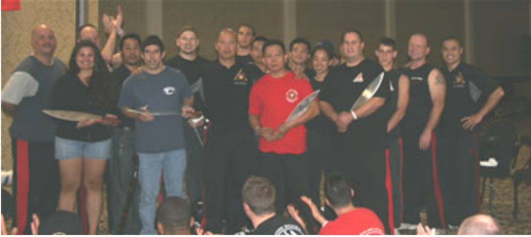
Receiving the Sportsmanship Award